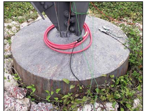
AmpFLEX™ cable positioned around the pylon footing

The number of coil turns, the amplification and the input channel can be selected directly on the C.A 6474.